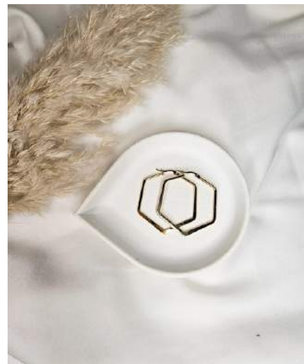
ROCK PAPER PRETTY Zinnia Hoops