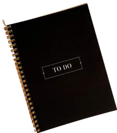
COCOLILY & CO. Luxe | Daily Planner To-Do List