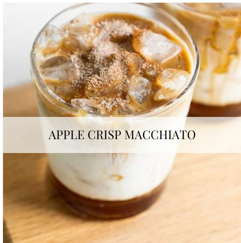
APPLE CRISP MACCHIATO