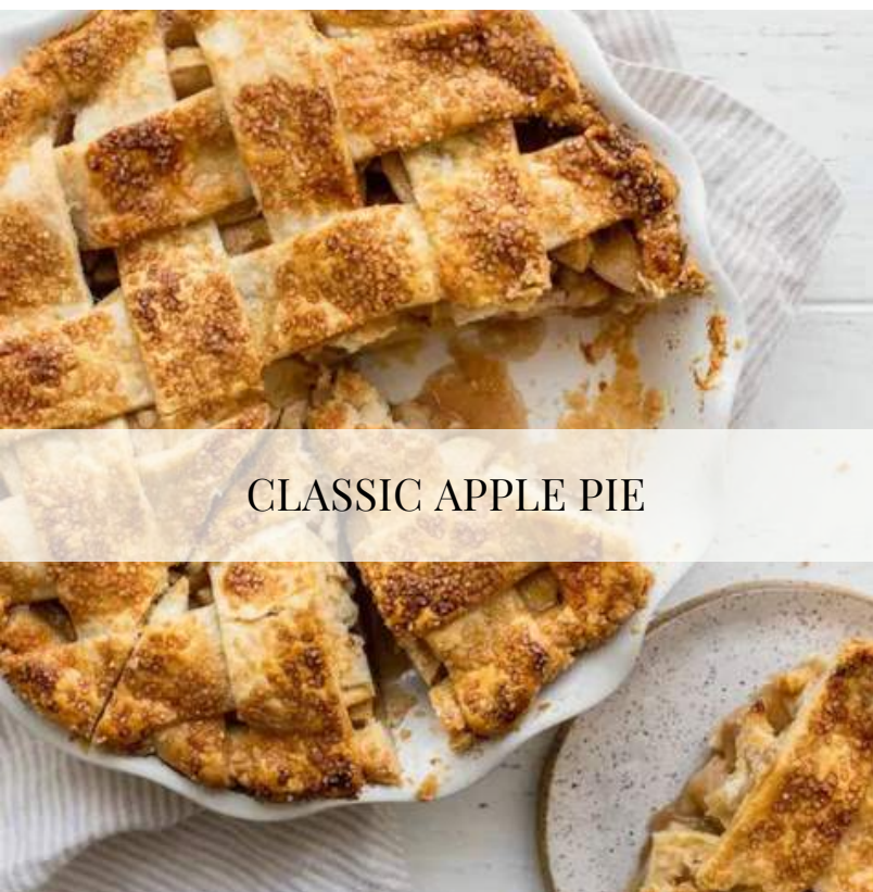
CLASSIC APPLE PIE