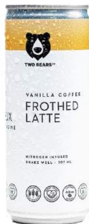
TWO BEARS COFFEE Frothed Vanilla Oat Latte