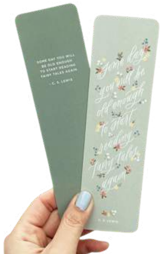
SELAH PAPER C. S. Lewis Fairytales Bookmark