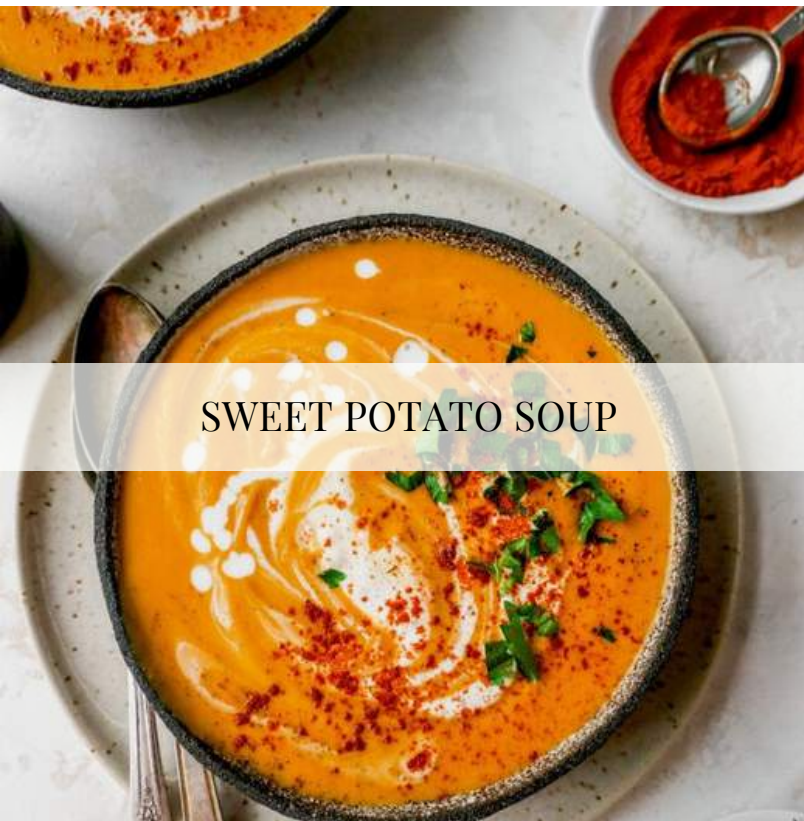
SWEET POTATO SOUP