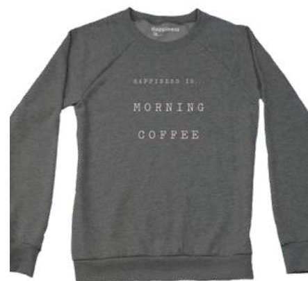
HAPPINESS IS... INC. Women's Coffee Crew Sweatshirt