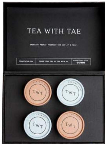
TEA WITH TAE Herbal Tea Bento Box